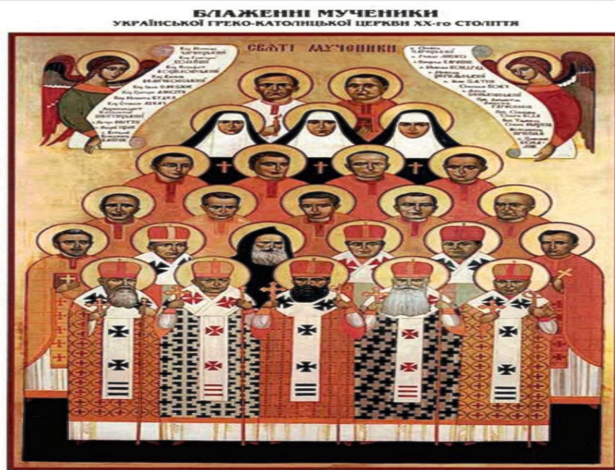
BLESSED MARTYRS OF THE UKRAINIAN CATHOLIC CHURCH IN THE 20th CENTURY

Red is the liturgical color of the day. This commemorates the martyrdom of both the saints. Remembering the witness of the chiefs among the Apostles calls to mind the universal Christian call to witness to Christ's Sovereignty, even with our very lives.